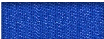
SD-2 ROYAL BLUE