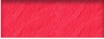
PL801 HOT CORAL