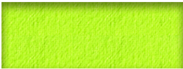
DPL805-1 DAY GLOW