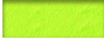
PL805 DAY GLOW