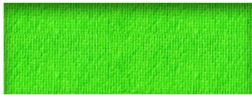
DPL807-1 KEY LIME