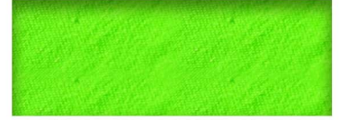
PL807 FL. LIME