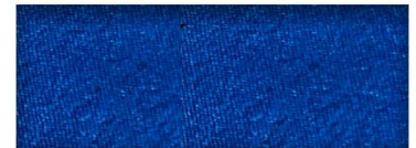
PL817 ROYAL BLUE