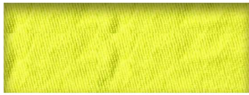
PL828 FL. YELLOW