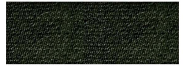
PL824 LAKE GREEN