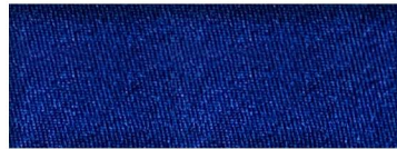
PL826 ROYAL BLUE